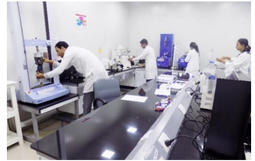
Photo shown on the right side is of Nissenken Jaipur Laboratory located in one of India's leading textile producing regions. And employed are Indian staff members who have completed specialized training programs.

In 2019, the achievement was recognized and we received a letter of recognition from the Ministry of Textiles, Government of India.